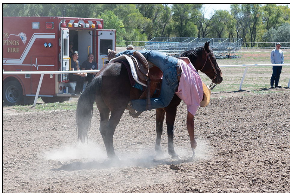
Horseback riders take turns grabbing for the Chicken Pull bag during this year's Southern Ute Tribal Fair and Rodeo on Saturday, Sept. 14. After the bag is pulled from the ground, contestants race around the track, trying to nab the bag and cross the finish line ahead of the competition.