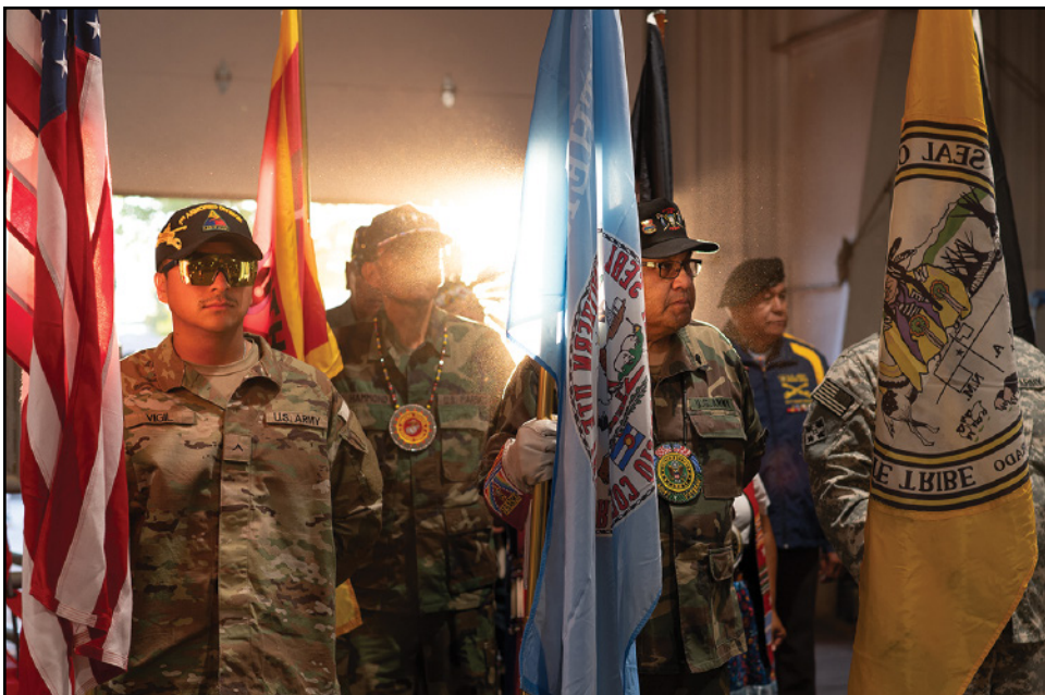
Members of the Southern Ute Veterans Association and other visiting veterans stand ready for the fourth session of Grand Entry on Saturday evening.