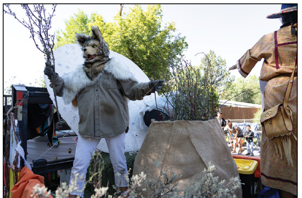
The Southern Ute Indian Montessori Academy plays out the Ute Creation Story with life size coyotes and willow bows for their annual parade entry.