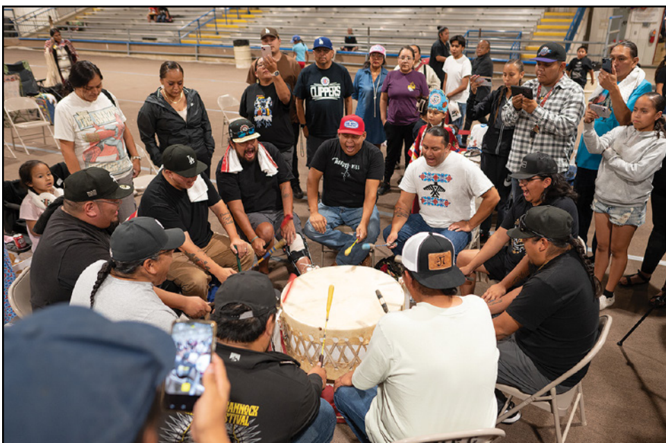
Drum group, Leading Arrow of Oklahoma took home first place in the 64th Annual Southern Ute Tribal Fair Powwow drum contest. Leading Arrow sang the final song on Sunday evening closing out this year's powwow and celebrating their win.