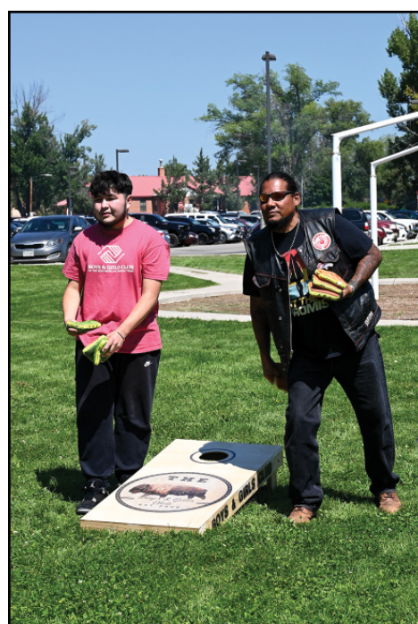
Rosaleigh Cloud/SU Drum

Kids of all ages were encouraged to participate in the watermelon eating contest. The contest was broken into age groups and participants were given watermelon slices according to their age. Kids 15-18 years old were given even bigger slices for an increased challenge!