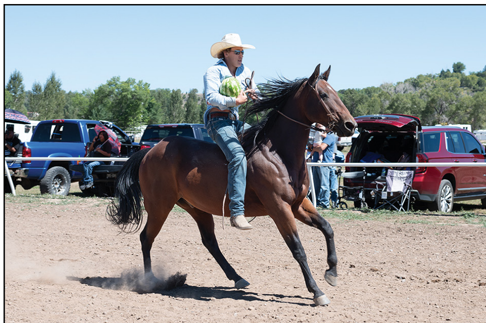
The annual watermelon race commenced on Saturday, Sept. 14 as part of the 102nd Annual Southern Ute Tribal Fair and Rodeo, participants race a 5/8-mile track without dropping their melons for a chance at cash prizes.